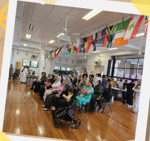
PROUD FAMILY MEMBERS AT THE STEMXPLAY SHOWCASE