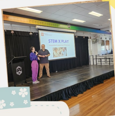
STEMXPLAY SHOWCASE UTS MENTORS