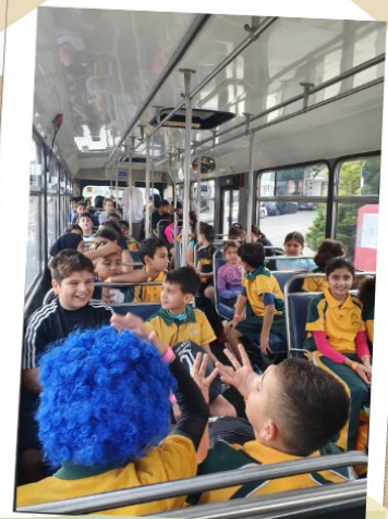
THE WHEELS ON THE BUS GO ROUND & ROUND...OFF TO THE SWIMMING CARNIVAL