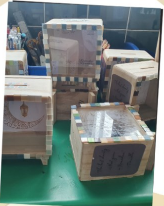
STARTING RAMADAN OFF WITH MAKING CHARITY BOXES