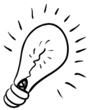
working with place value- making 'teen' numbers

Imagination blooms as they create and play, Nurturing their minds in every possible way, Dancing through letters and numbers each day, Eager to grow, in Prekindergarten they stay, Reaching for knowledge, they're on their own way, Growing and thriving, come what may, Adventure and learning, in every word they say, Ready for the future, in Prekindergarten, they'll sway, Together they journey, come what may, Eager and hopeful, in their hearts, they pray, Nurturing dreams, they're here to stay.