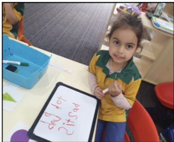
segmenting and writing CVC words